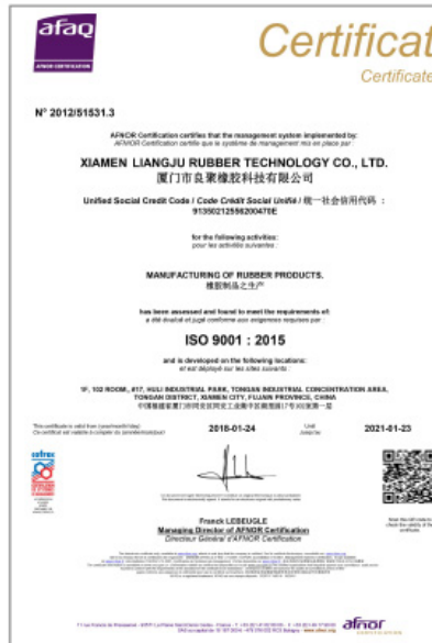
ISO 9001 : 2015

Our packing for all the Customized Shape Rubber Gaskets, strong enough to ensure its safety throughout the whole delivery no matter domestic or overseas shipping. Customized Packing/LOGO/Labeling are Available.