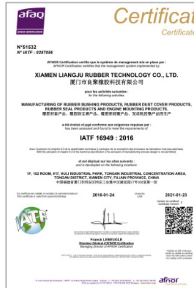
IATF 16949 : 2016